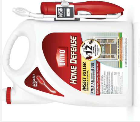
ORTHO HOME DEFENSE PERIMETER AND INDOOR INSECT KILLER WITH WAND