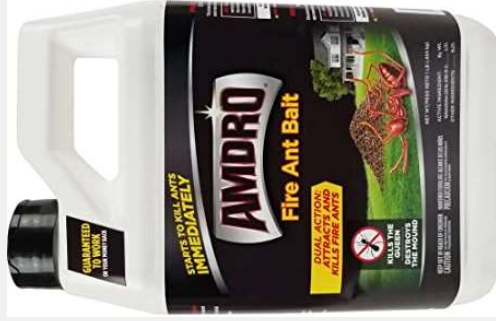
AMDRO 1LB. FIRE ANT BAIT