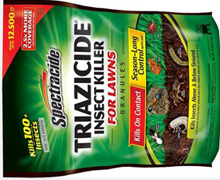
SPECTRACIDE 10 LBS. TRIAZICIDE LAWN INSECT KILLER GRANULES