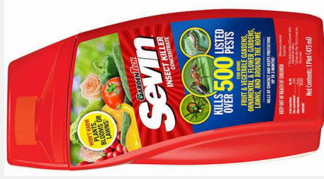
SEVIN 32 OZ. CONCENTRATE OUTDOOR INSECT KILLER